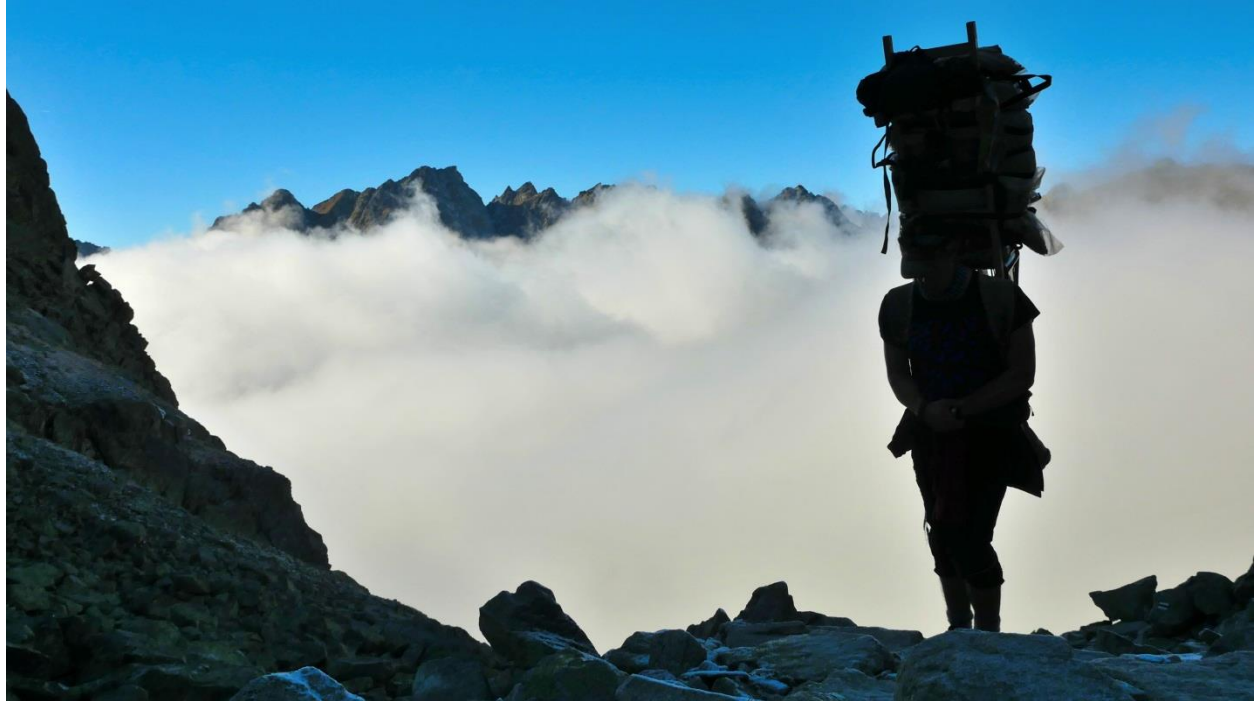
Freedom Under Load

With 100 kilos on their backs, they face storms, blizzards, and deep snow. Their traditional craft is not only a profession. For the oldest generation of porters in the High Tatras Mountains, it is also a method of meditation and self-discovery.