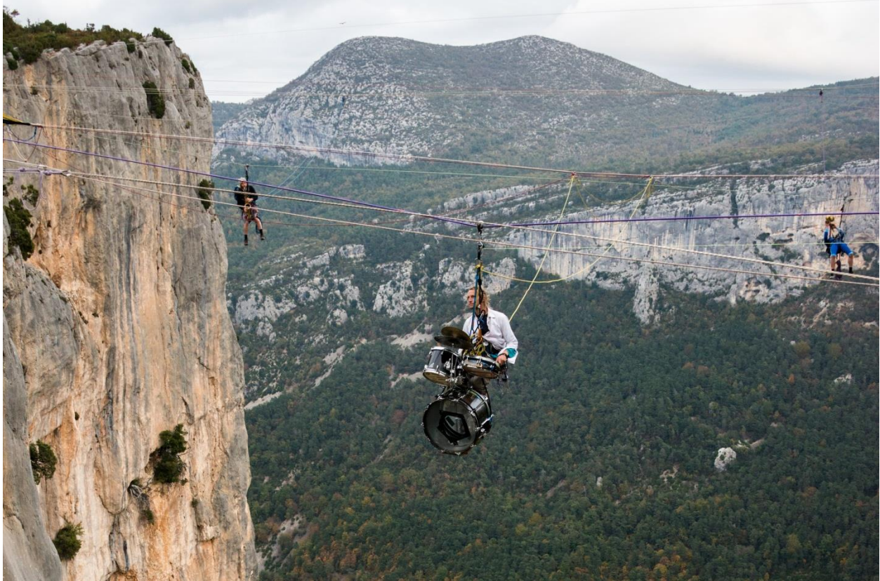
Metronomic

Production Company: Baraka Films & Flying Frenchies