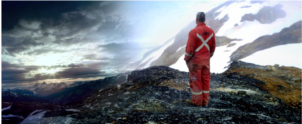
Taken from the film KONELĪNE: our land beautiful

Production Company: Canada Wild Productions