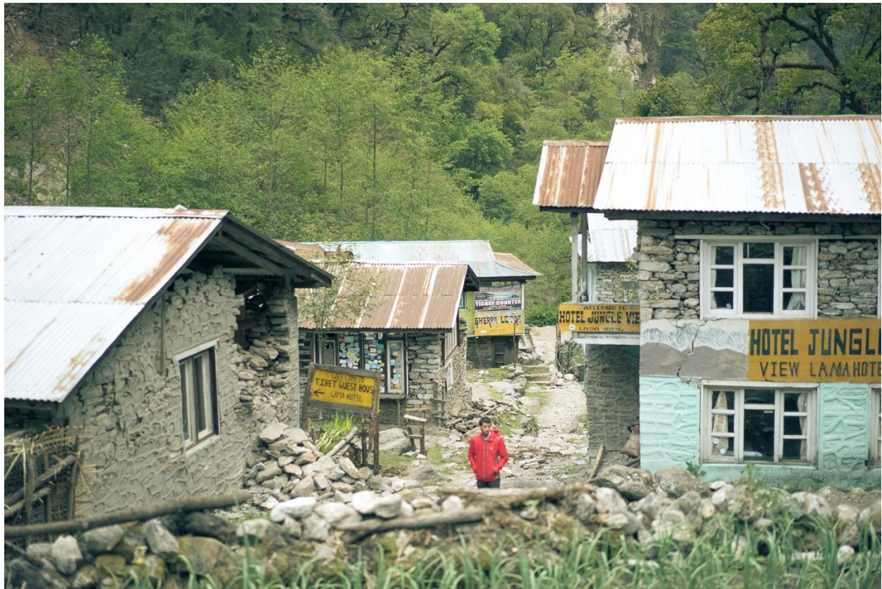
Taken from the film Langtang: Summits of My Life III