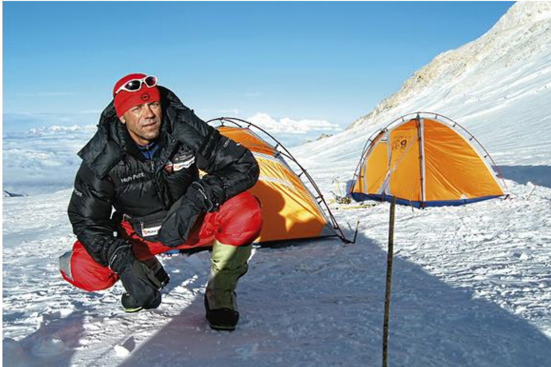
Climbing Higher

Czech climber Radek Jaroš's story is one of determination and of overcoming shared and personal limits. It is also the story of compromise and of the price paid to achieve every mountain climber's dream: ascending the Crown of the Himalayas, the world's 14 tallest mountains.