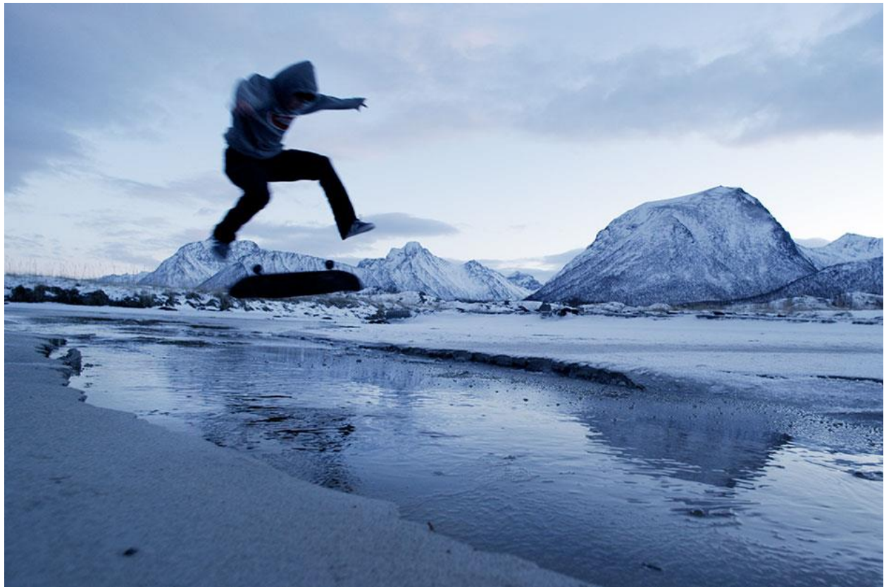
Taken from the film Northbound

Four skateboarders head north above the Arctic Circle to the cold Norwegian coast to apply their urban riding skills to a canvas of beach flotsam, frozen sand, and pastel skies. The result is a beautiful mashup of biting winds, ollies, and one ephemeral miniramp.