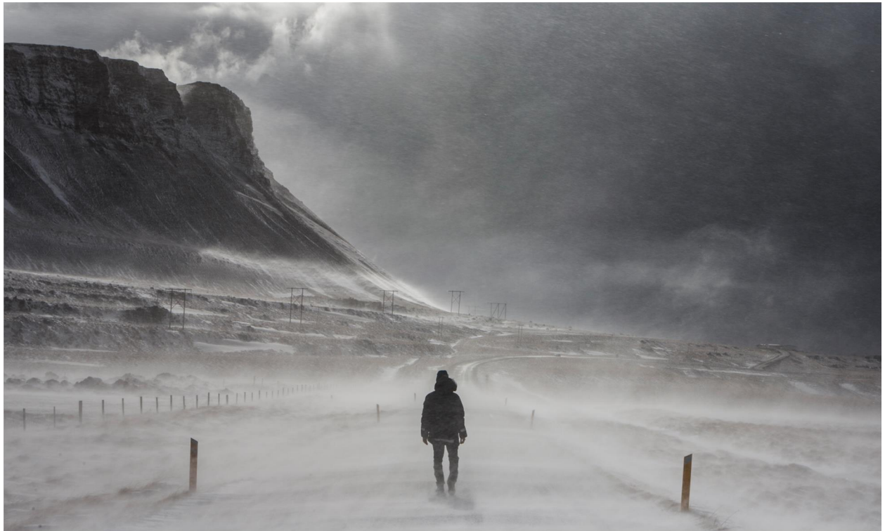
Taken from the film, The Accord

Production Company: Tributaries Digital Cinema