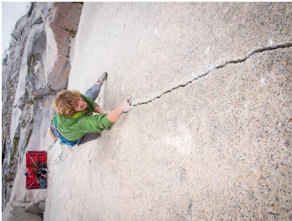
Boys in the Bugs