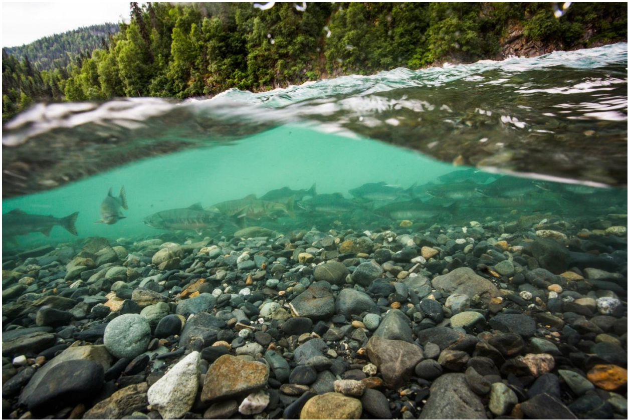
The Super Salmon

Proponents of a plan to construct a $5.2-billion hydroelectric mega-dam on Alaska's Susitna River say it wouldn't affect the watershed's famous salmon runs because of its location . upstream of where fish usually swim. Tell that to the Super Salmon.