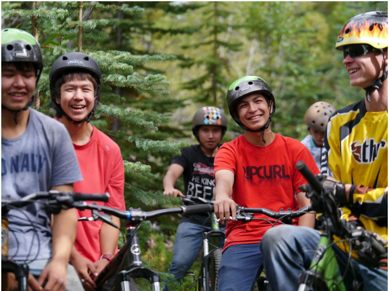
SHIFT © Derek Crowe

Production Company: Shot in the Dark Productions