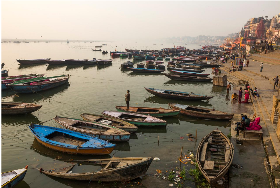
Holy (un)Holy River

Production Company: Mountain World and Pete McBride Productions